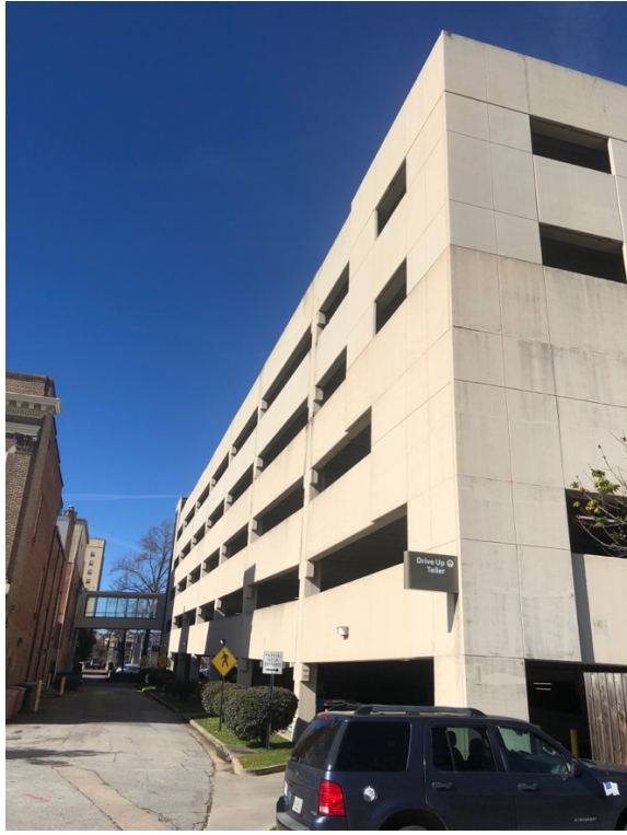
Parking Garage facing Mulberry St. Lane

All applications will be reviewed by the Macon-Bibb County Public Art Commission that represents a cross section of government officials and art professionals from Macon including administrators, educators, and artists.