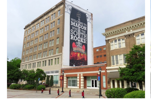
Downtown Macon, GA